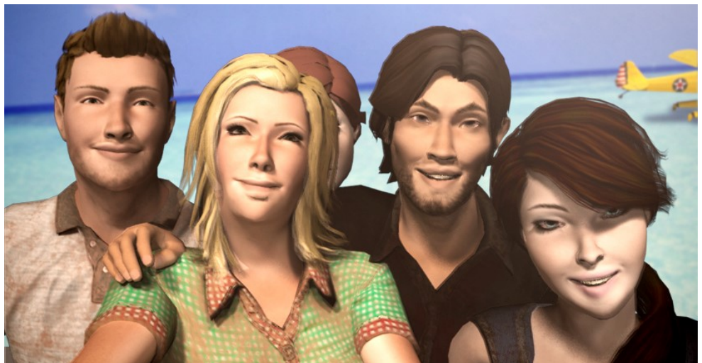
A videogame frame

Knowing your aptitudes, or knowing yourself as Socrates affirmed, is fundamental for both individuals and organizations. It enables the individual to identify those professions for which they are most "suited", and organizations to avoid placing individuals in roles for which they are not at all suited.